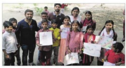
Students after a plantation drive at the IIM, Amritsar.

AMRITSAR, NOVEMBER 18 Young management students of the Indian Institute of Management, Amritsar, are making sure to serve their bit to society through Sankalp, a CSR club of the institute. The group of 56 students is creating awareness on social issues, holding activities and involving others students for the same. Students are also addressing issues such as drug menace, water conservation, and environment and plantation drive among others. Soon, they will coach school students for various competitive exams under their school programme. Until last year, the institution was working with a Manawala-